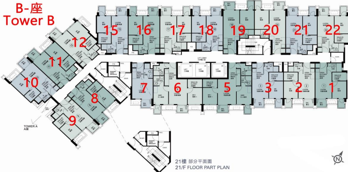
21樓部分平面圖 21/F FLOOR PART PLAN