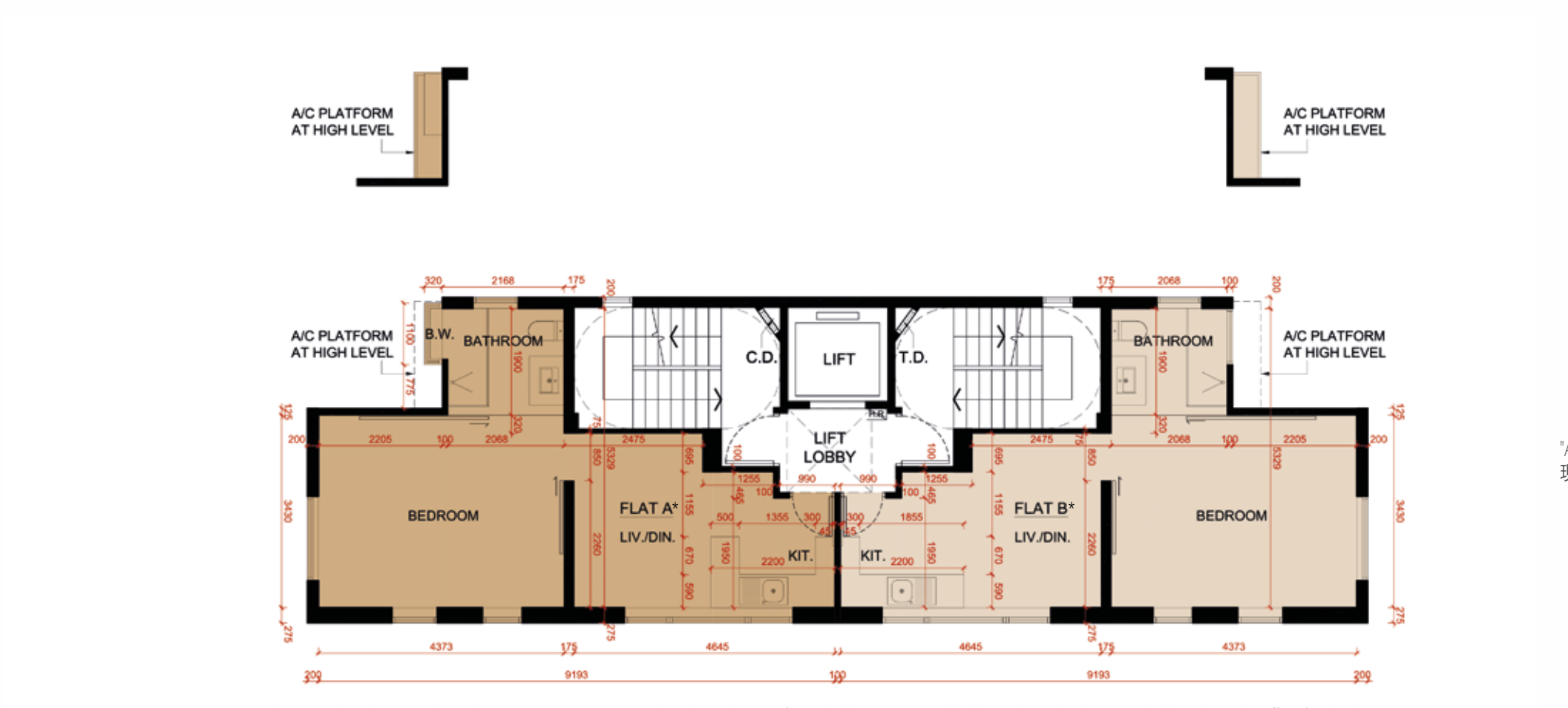
"As-is" Layout Plan 現狀平面圖

*Alterations have been made in the Living / Dining Room and Kitchen. Please refer to the latest approved building plans which are available at the sales office for details. *客飯廳及廚房曾作出改動。詳情請參閱存於售樓處的最新批准建築圖則。